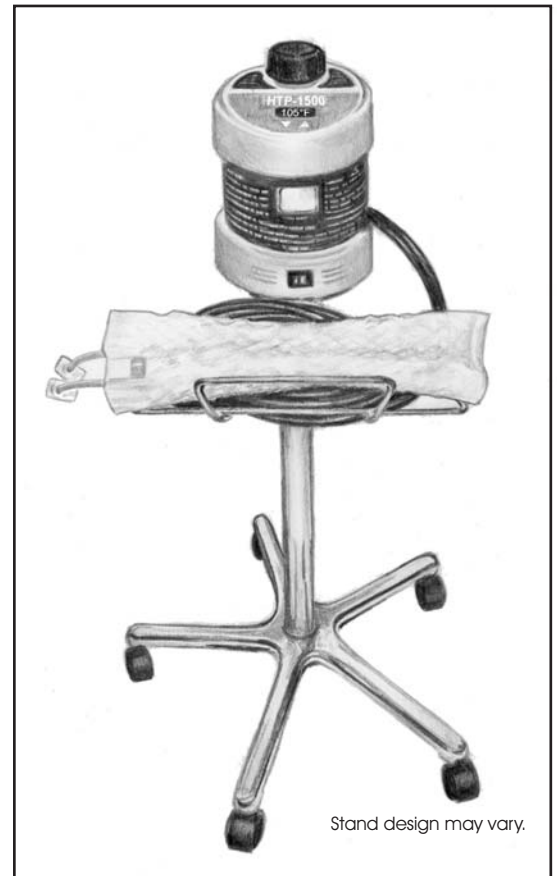
Optional stand is perfect for bedside use Order with or without a pad cradle